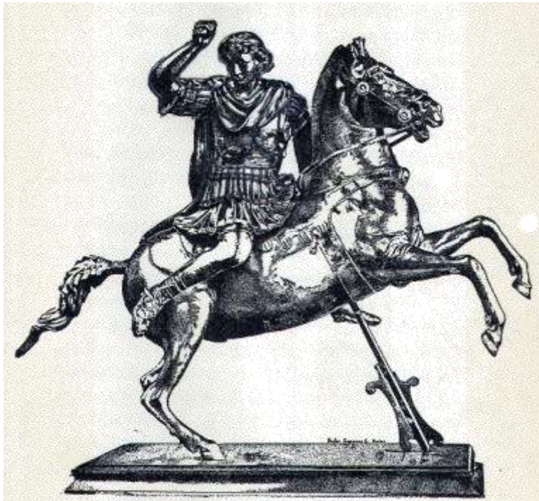
ALEXANDER THE GREAT

When King Philip had conquered the Greeks, he treated them kindly, but he made them choose him to be their leader. Then he told them that he was planning to go on into Asian and