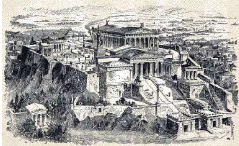
THE ACROPOLIS OF ATHENS ( RESTORATION ).

Far, far away from our own country, across wide seas and many strange lands, is a beautiful country called Greece. There the sky is bluer than our own; the winters are short and mild, and the summers long and pleasant. In whatever direction you look, in that land, you may see the top of some tall mountain reaching up toward the sky. Between the mountains lie beautiful deep valleys, and small sunny plains, while almost all around the land stretches a bright blue sea.