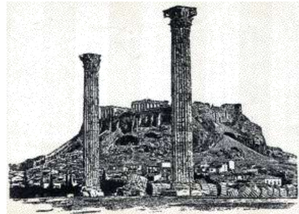
COLUMNS OF THE TEMPLE AT ZEUS TO ATHENS.

In the northern part of Greece there was a very high mountain called Mount Olympus; so high that during almost all the year its top was covered with snow, and often, too, it was wrapped in clouds. Its sides were very steep, and covered with thick forests of oak and beech trees.