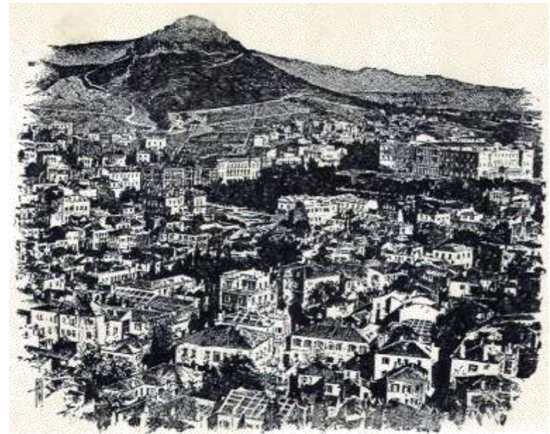
ATHENS AS IT IS NOW.

At Athens the troubles which led the people to call upon Solon to make laws for them did not come from wars with their enemies, but from quarrels in the city itself. There had once been kings at Athens who ruled over the people, but these had been overthrown, and the city was now what we call a republic; that is, certain men were chosen each year to rule over the others. But instead of letting all the people choose these men, as we do