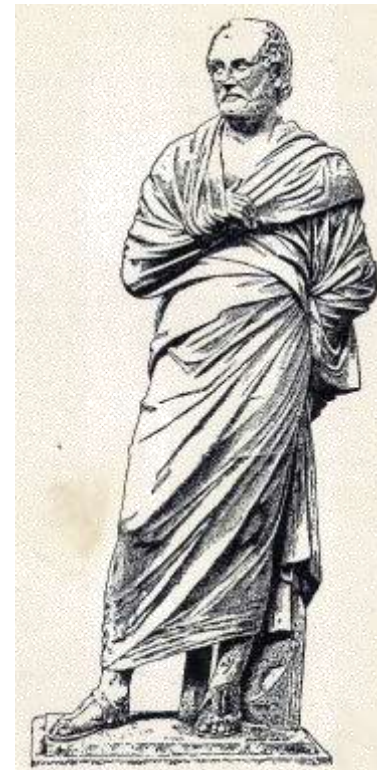
AN ATHENIAN GENTLEMAN.

Among the Athenians who fought at Salamis was one named Aristides, who was called "the Just." He is as famous as Themistocles, but for a different reason. He was not so quick-witted as Themistocles, nor so good a general; but he was so fair and honest in all that he did, that men said, "There is not in all Athens a man so worthy or so just as he."