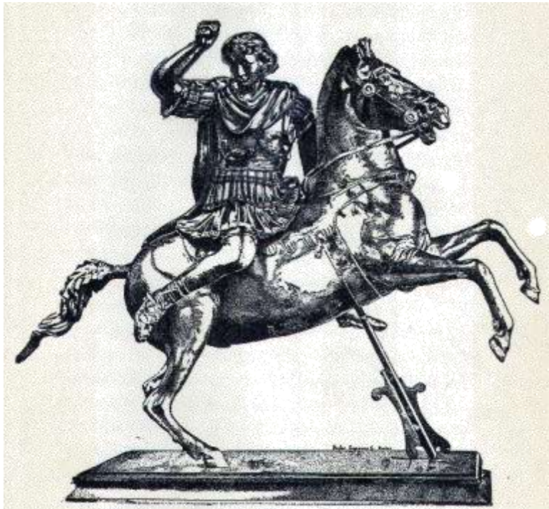
ALEXANDER THE GREAT

When King Philip had conquered the Greeks, he treated them kindly, but he made them choose him to be their leader. Then he told them that he was planning to go on into Asian and