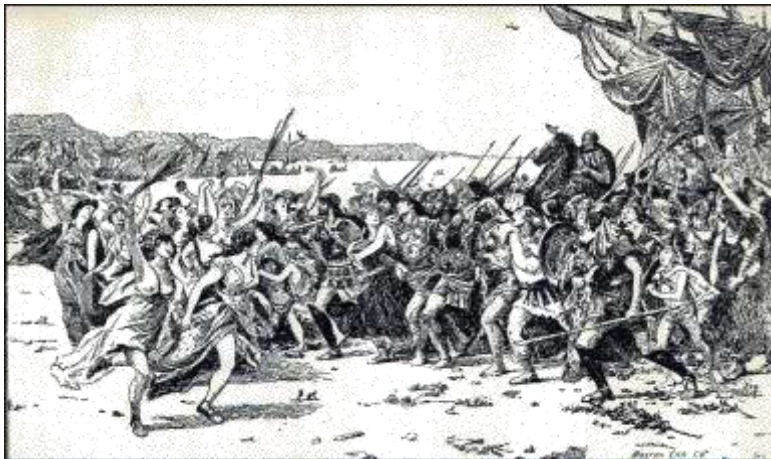
RETURN OF THE VICTORS FROM SALAMIS.

From Thermopylae, King Xerxes and his army marched down into Greece, punishing the people of all the places that had refused to send him earth and water. At Athens the people were in great fear. They knew that their turn would come next, and that the great king would punish them more severely than any of the other Greeks because they had once burned one of his cities. They sent to the oracle at Delphi and asked,—