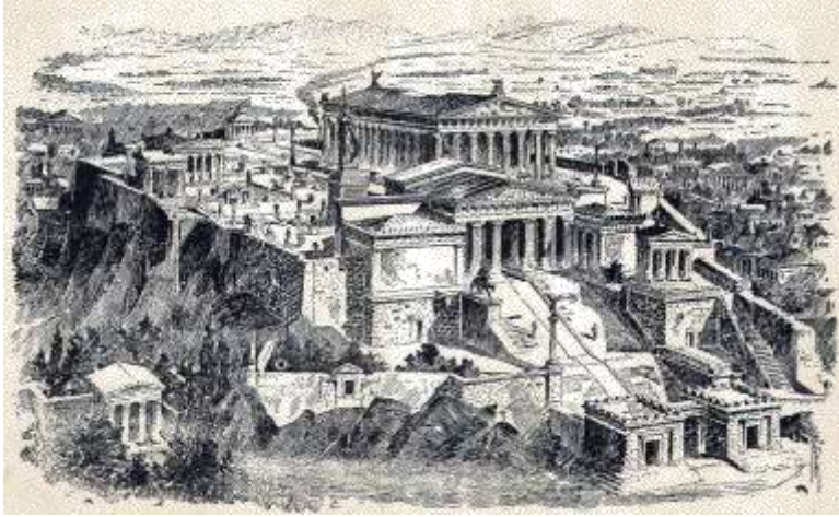
THE ACROPOLIS OF ATHENS ( RESTORATION ).

Far, far away from our own country, across wide seas and many strange lands, is a beautiful country called Greece. There the sky is bluer than our own; the winters are short and mild, and the summers long and pleasant. In whatever direction you look, in that land, you may see the top of some tall mountain reaching up toward the sky. Between the mountains lie beautiful deep valleys, and small sunny plains, while almost all around the land stretches a bright blue sea.