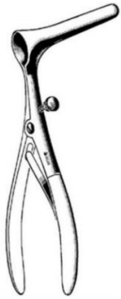
Killian Nasal Speculum