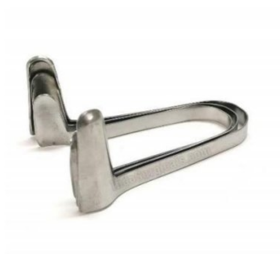
Thudicum Nasal Speculum